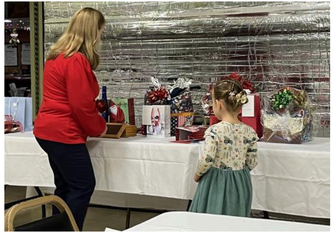
Clockwise from top-right: Tickets are drawn for the auction by Cass Dahlgren; Hope guides Cass to the next drawing; The POW-MIA table and assembled crowd; Another view of the same.