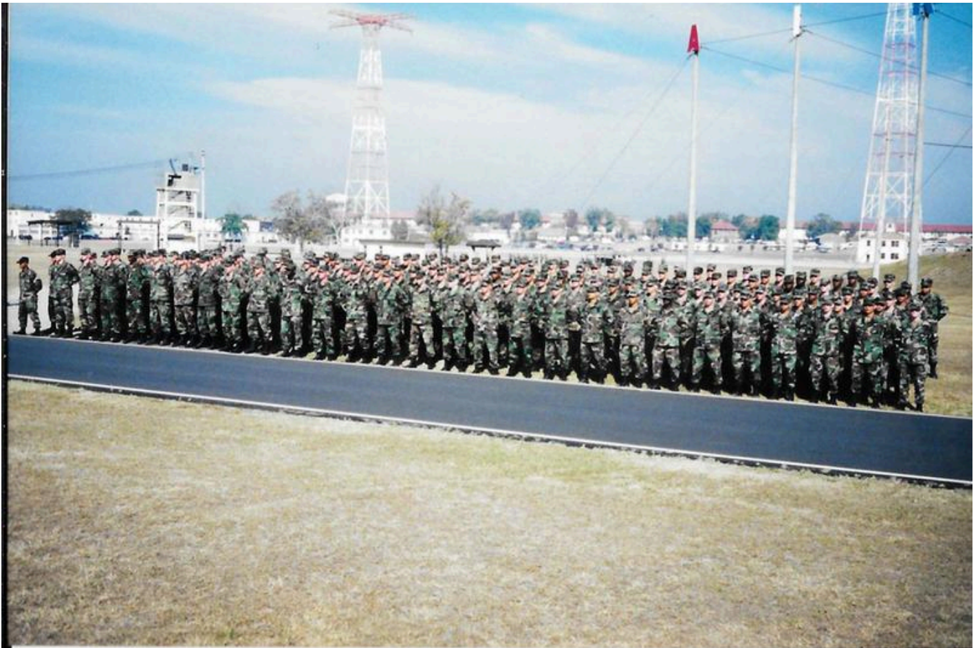
Ft. Benning, GA, airborne graduation November 2001.

The Canopy Box 1324 Minneola, FL 34755-1324