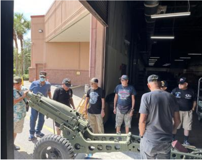
Above and below: Day zero cannon setup. Your prize for an early arrival! Bottom left: Association banquet - what a crowd!