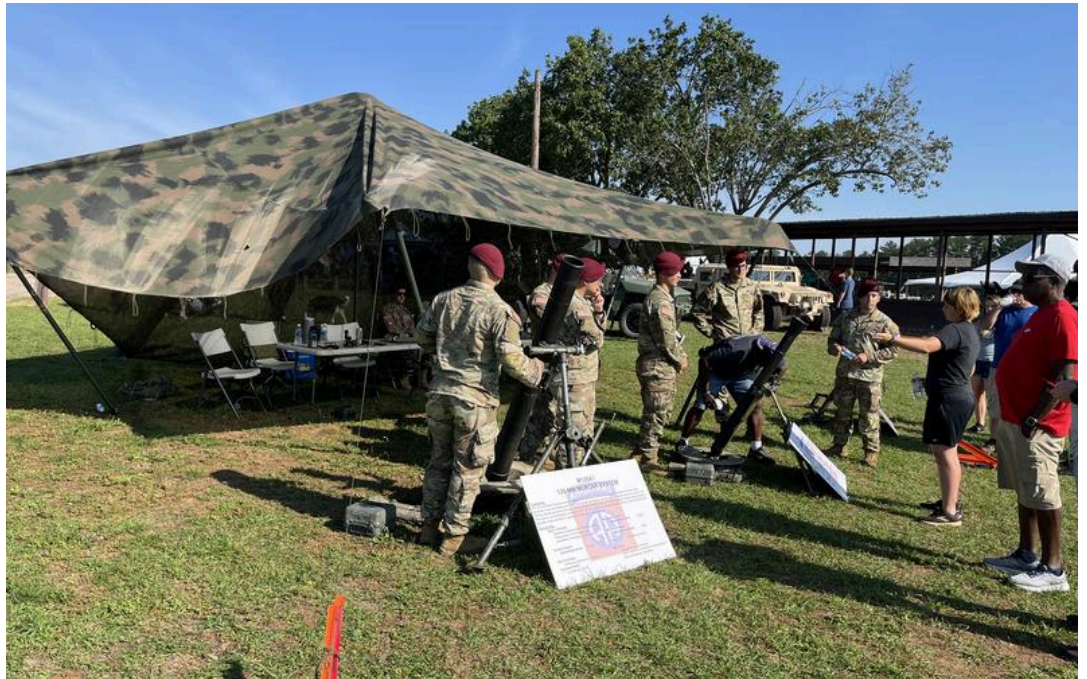
Mortar system static display.