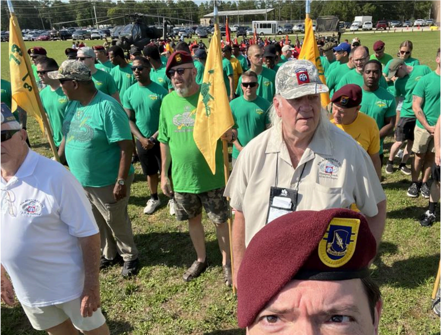
Above: The Veteran formation for the Division Review. Lower right: The Chorus performs at the Association Banquet.