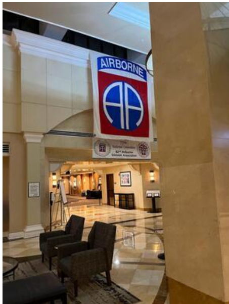
Unfortunately, the jump was scrapped for this convention - allegedly due to aircraft availability.

Wednesday night included an incredible dinner hosted by Walter Rauscher. It was truly nonpareil !